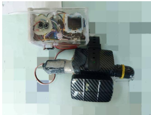
Fig3 Proposed system

The accuracy of the LPS33HW pressure sensor was validated against standard measurement devices, confirming reliable submersion depth detection. Similarly, the SEN18 water presence sensor consistently detected water contact, reducing the chances of false triggers and improving the system's overall reliability. The combination of these sensors ensured that drowning detection was precise and responsive.