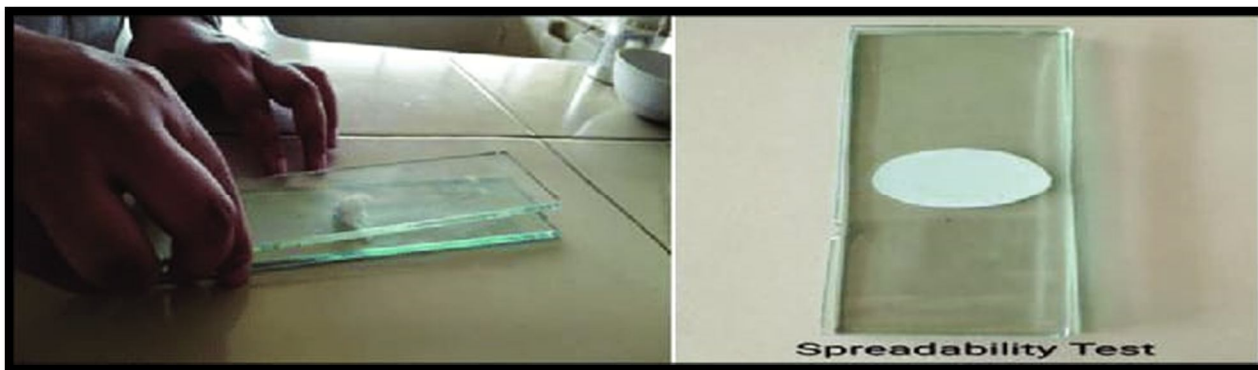
Fig No (8) :- Spreadability test

Microbial growth test: By using the streak plate approach, the created cream was inoculated into the plates of Muller Hinton agar media, and a control was created by leaving out the cream. The plates were put in the incubator, where they were left there for 24 hours at 37°C. Following incubation, plates were removed and examined compare it to the control to determine the microbial growth (4).