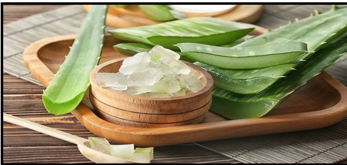
Fig No (4) :- Aloe Vera

Source biological: Ocimum species, including Ocimum, provide the fresh and dried leaves used to make tulsi. Ocimum basilicum L., sanctum L., etc. Ocimum tenuiflorum is known scientifically as. (11)