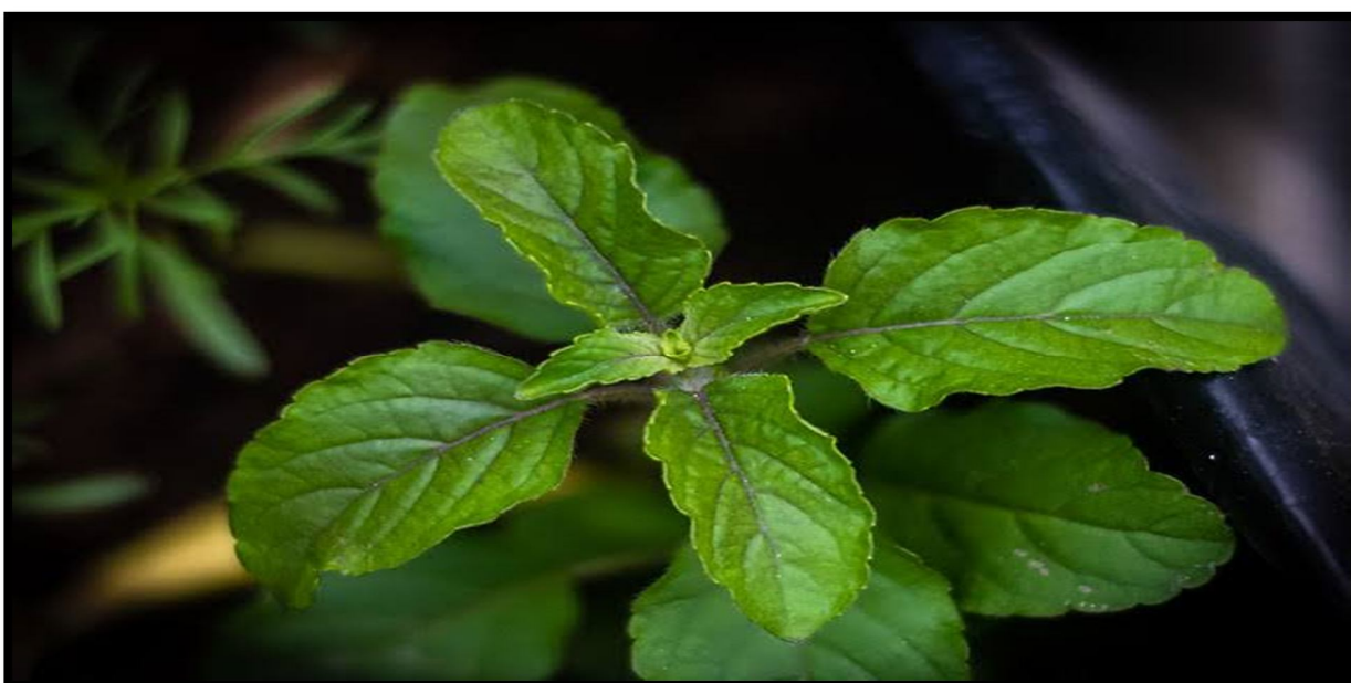
Fig No (6) :- Tulsi

utilised chemical component: eugenol (17)