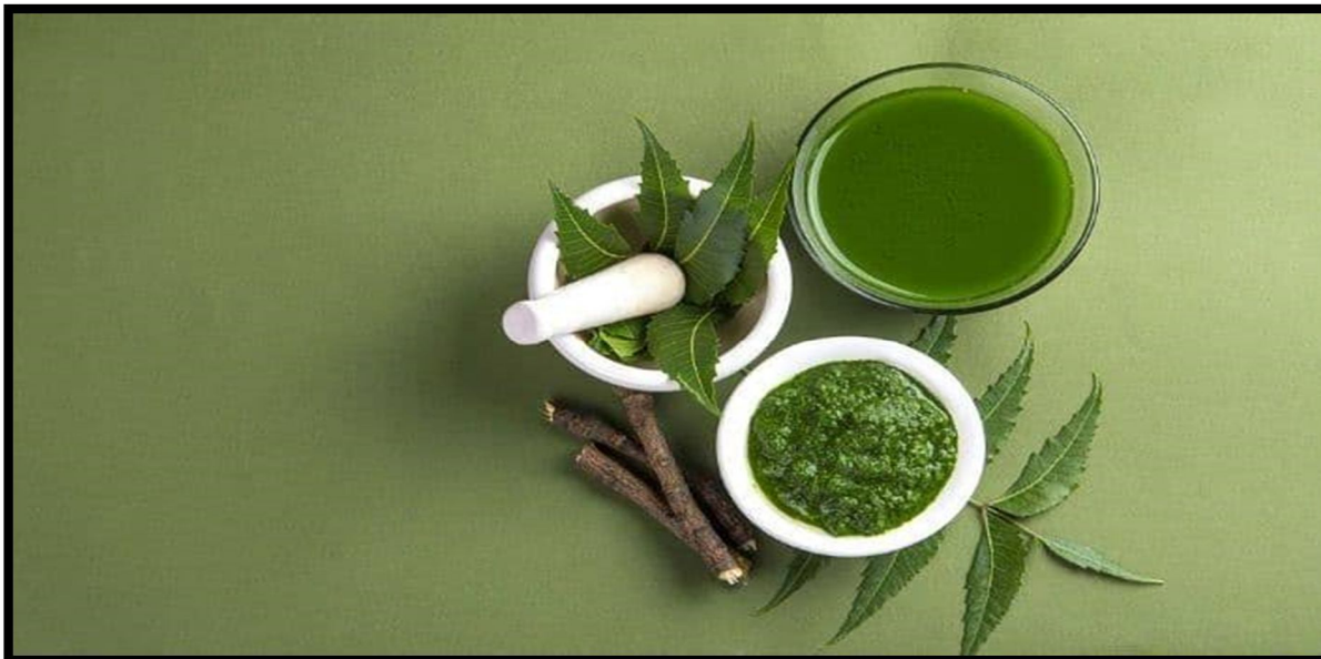
Fig No (5) :- Neem