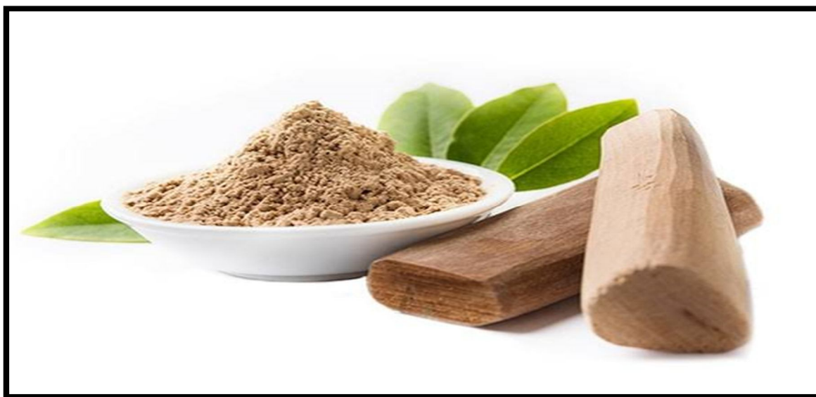
Fig No (7) :- Sandalwood

Biological source: the stem and roots of the tiny, evergreen tree Santalum album Linn. the Santalaceae family.