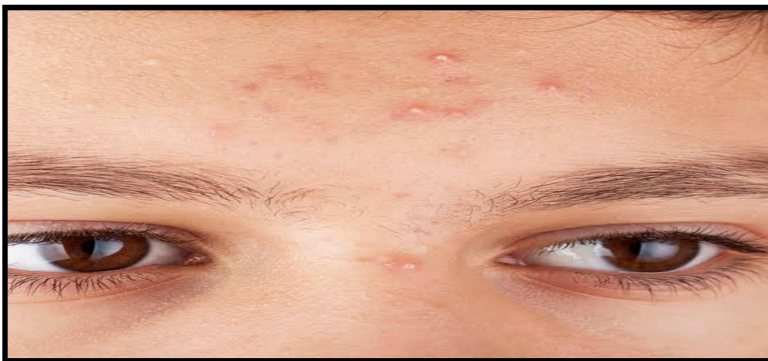
Fig No (2) :- Acne Vulgaris