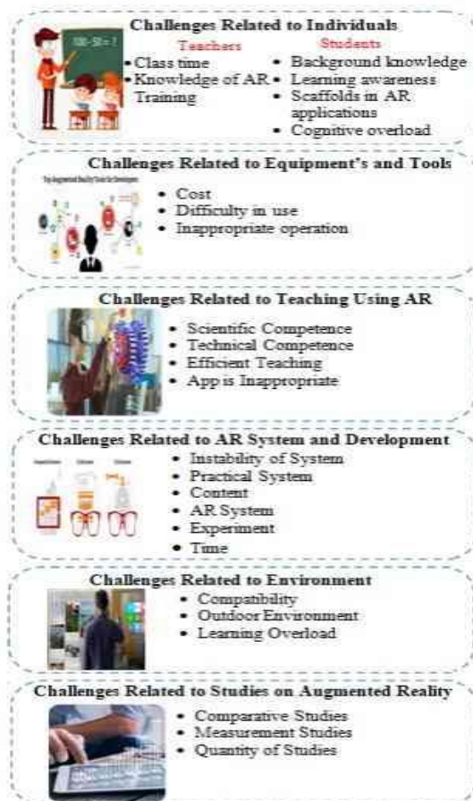
Figure 1: Challenges Overview