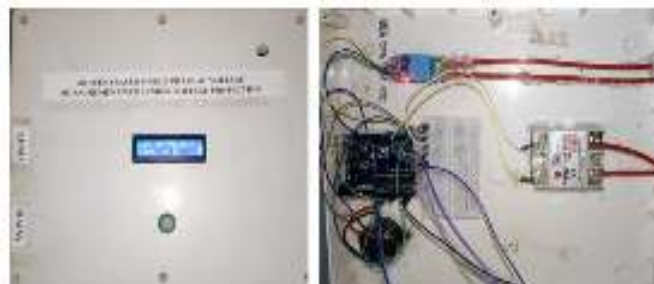
Fig. 2. KIT PHOTO