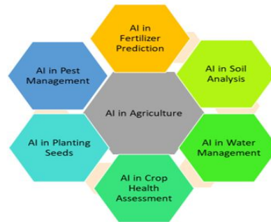
Fig.1 AI in Agriculture

It can aid farmers with processes such as deciding which crop to select, when to plant it, how much to irrigate, when to apply fertilizer, when to conduct pest management and which pesticide should be used, by leveraging AI data from ML [9]. AI can help to understand the response of seeds to varying conditions of weather and soil types [10]. Using this information can help to reduce the likelihood of plant diseases. (Fig.1)