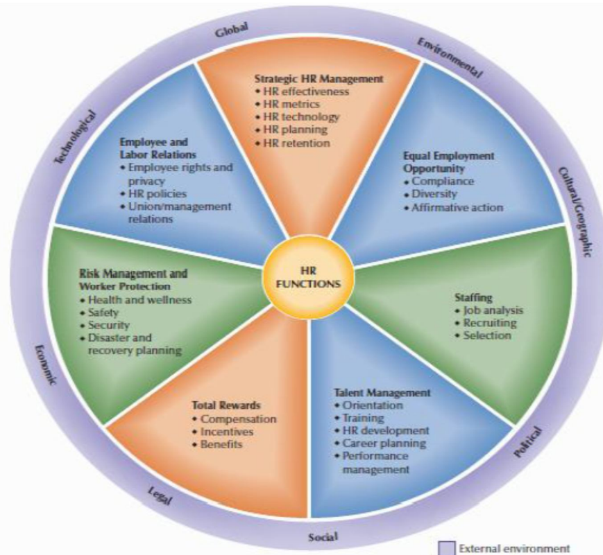
Figure- 2: Functions of HRM

Human Resources management has an important role to play in equipping organizations to meet the challenges of an expanding and increasingly competitive sector. Increase in staff numbers, contractual diversification and changes in demographic profile which compel the HR managers to reconfigure the role and significance of human resources management. The functions are responsive to current staffing needs, but can be proactive in reshaping organizational objectives. All the functions of HRM are correlated with the core objectives of HRM.