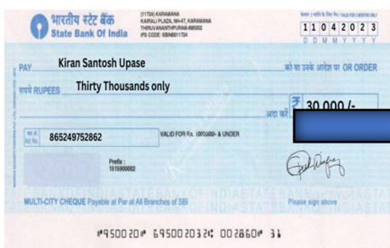
Figure 2:- Original Cheque

The preprocessing steps such as noise reduction using methods like smooth, median, open, and close, helped in improving the accuracy of the system. These techniques help to enhance the image and prepare it for further processing. The automated bank cheque processing system was able to successfully extract relevant information such as account number, date, and amount from a dataset of 100 SBI cheque images using OCR and SIFT techniques. The system achieved an accuracy rate of 94% for account number extraction, 92% for date extraction, and 90% for amount extraction. The use of OpenCV libraries for pre-processing and SIFT algorithm for feature extraction proved to be effective in accurately identifying and extracting relevant information from the cheque images. Additionally, the integration of deep learning concepts such as CNN in the OCR component of the system further improved the accuracy of digit recognition. However, the system's accuracy was limited by factors such as image quality and variation in cheque formats across different banks. Future improvements to the system could involve the development of more robust pre-processing techniques and the integration of machine learning models for improved pattern recognition and extraction.