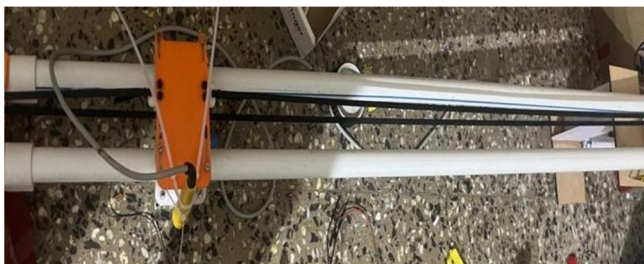
Fig5. Displays the main part of the system, the soldering gun move with conveyor belt while rotating the stepper motor. The soldering gun move with bearings for smooth movement