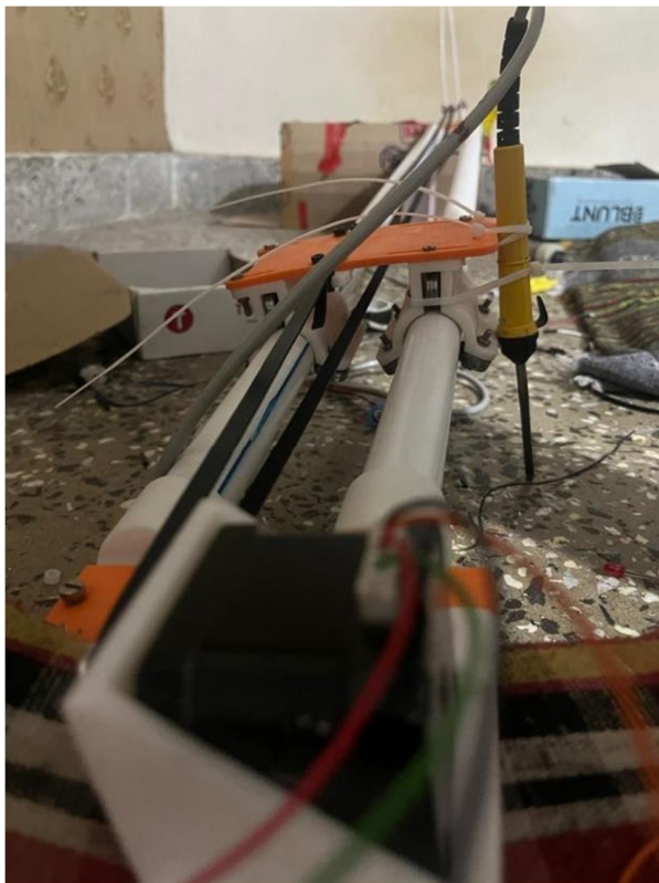
Fig3. Stepper Motor Connected with Conveyor Belt