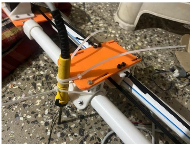
Fig4. display the soldering gun connected with the conveyor belt. stepper motor moves the soldering gun using conveyor belt