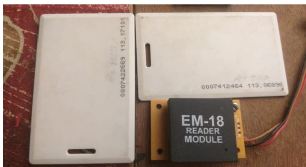
Fig2. RFID cards, EM 18 RFID card reader