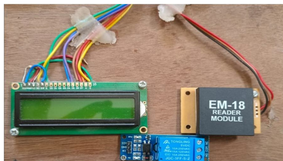
Fig1. showing Em Reader module, Relay module

RFID stands for radio frequency identification, a wireless data transfer technology that makes use of electromagnetic fields [4]. Tags, a reader, associated antennas, and a middleware program that is incorporated into a host system make up the three primary parts of an RFID system [4],[8]. Tags come in three primary varieties: semiactive, passive, and active. Passive tags are those without an internal power source; semi-active tags are those with an internal power source but only use it to power their internal memory circuitry; and active tags are those with an internal power unit that powers both their internal circuitry and their antenna unit for communication [4].