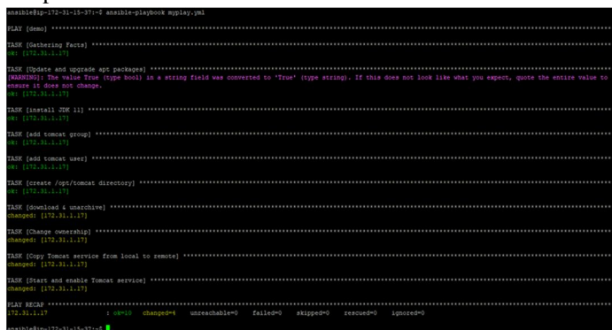
Fig. 2: Running ansible playbook

The below diagram will illustrate the process in a clear manner