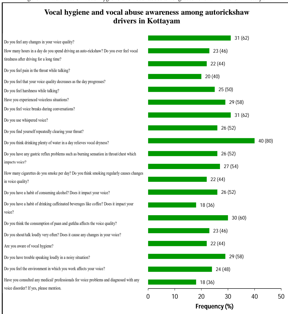
Figure 1: Awareness on vocal hygiene and vocal abuse among autorickshaw drivers in Kottayam.