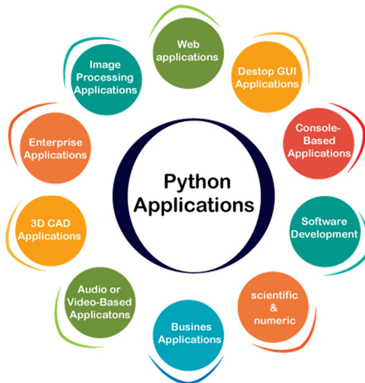
Fig. 2 Common Applications of Python Programming Language [8]

The above mentioned are common applications which are built through Python Programming Language. In this paper, we will discuss some of the areas where Python Programming Language provides ease of building an application, web development and many more.