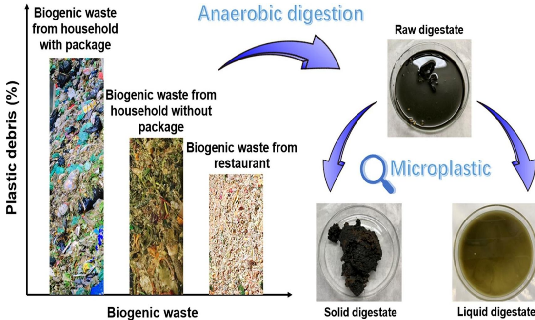
Figure 2. Different sources of biogenic wastes and anaerobic digestion produce solid and liquid digestate to produce different materials.[25]

Finally, we may conclude that animal manure can be exploited by various biological and physio-chemical techniques for the production of many valuable materials ranging from agriculture to daily commercial products as well as bioenergetic resources. The energy produced through animal manure can minimize carbon emissions and may play a pivotal role in minimizing the pollution of air, water and other natural resources.