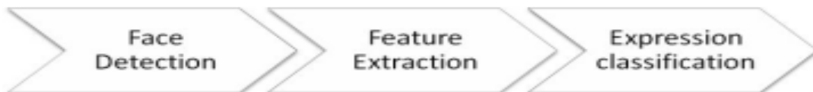
Fig. 1.1 Three stages for human Facial Expression Recognition

The expression of an independent can be researched to choose if a human is fit or not so much for a fragile endeavor. Computing can likewise be furnished with Facial Expression Detection (FER) limit to further develop the use. Person to person communication associations might incorporate features that suggest stand of the customer's position depending upon expression of the moved photo. Hardly any phone cameras at this point possess the part of getting the photo with perceiving the emotional faces. As all the thing is obtaining mechanized, so an authoritative goal is to empower equipped to see facial expression immediately as an individual can do. The following figure represents three significant stages in facial expression recognition.