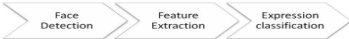
Fig. 1.1 Three stages for human Facial Expression Recognition

The expression of an independent can be researched to choose if a human is fit or not so much for a fragile endeavor. Computing can likewise be furnished with Facial Expression Detection (FER) limit to further develop the use. Person to person communication associations might incorporate features that suggest stand of the customer's position depending upon expression of the moved photo. Hardly any phone cameras at this point possess the part of getting the photo with perceiving the emotional faces. As all the thing is obtaining mechanized, so an authoritative goal is to empower equipped to see facial expression immediately as an individual can do. The following figure represents three significant stages in facial expression recognition.