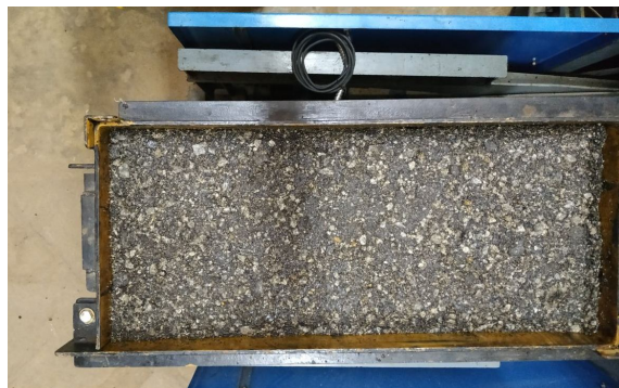
Fig. 3 Compacted DBM Grade II Layer in RCRA