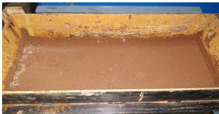
Fig. 2 Compacted Sub Grade