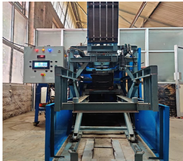
Fig. 1 Roller compactor and rut analyser

The moulds are designed to build the different layers of pavement to bring the reality in the testing. The thickness of the different layers prepared/casted in RCRA moulds are as per the standard plates given in IRC 37-2012. The dimension of the mould used is 650 mm X 270 mm with varying heights. The compacted specimen of subgrade and bituminous layer is shown in Fig.2 and Fig.3 respectively.