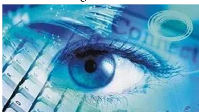
Fig 1.1 blue eye technology [1]

Imagine yourself during a world where humans interact with computers. Blue eyes technology is the Blue refers to Bluetooth and Eye refers to seeking the information from our feelings. It's the power to collect information about you and interact with it through special techniques like face recognition, speech recognition, etc. Even if you can understand your emotions at the touch of the mouse. It verifies your identity, feels your presents, and starts interacting with you. Human recognition depends totally on the power to perceive, interpret, and integrate audio-visuals and sensing [3] .