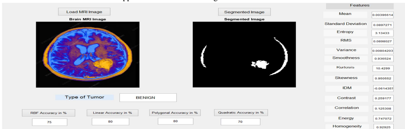
Fig 2. Output image

The algorithm was in-house developed via the wavelet toolbox, the biostatistical toolbox of Matlab 2011b. The open SVM toolbox and extended it to Kernel SVM which is applied to the MR brain images classification.