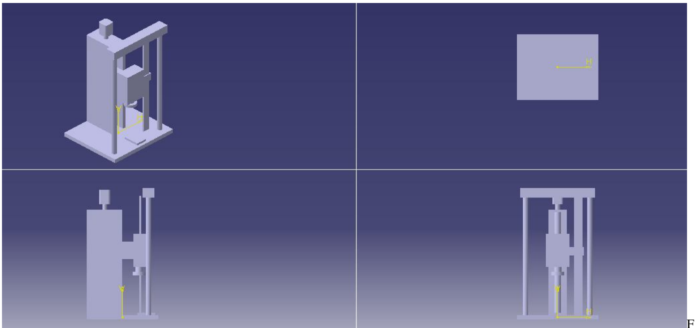
ig.IV.1 Orthographic view of Spring Load Testing Machine

The projection is designed on DASSAULT CATIAV5 software. A spring load testing machine is a device used to test the strength and durability of springs. To create an orthographic projection of this machine, one would need to take multiple views from different angles, including front, side, and top views.