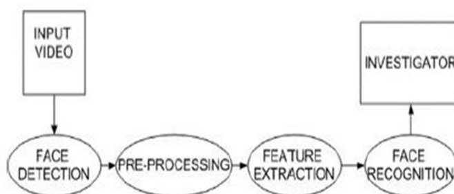
Fig. 3. CCTV Recognition Process.

The Components we used are Arduino for the Automated Parking System. And for Premises Security System we used Raspberry Pi, which performs face recognition and fingerprint recognition and stores the data in the database, and even cross-checks the new data with the old data. Arduino consists of both a physical programmable circuit board that runs on your computer, used to write and upload computer code to the physical board. Raspberry Pi is popularly used for real time Image/Video Processing, IoT based applications and Robotics applications. The raspberry pi board comprises a program memory (RAM), processor and graphics chip, CPU, GPU, Ethernet port, GPIO pins, Xbee socket, UART, power source connector. And various interfaces for other external devices.