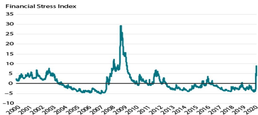
Figure 2 Financial Stress

SOURCE: The Financial Stress Index is a measure of the Office of Financial Research, an independent bureau within the U.S. Department of the Treasury. The Index takes into account current credit conditions, equity valuations, access to funding, value of safe assets, and market volatility.