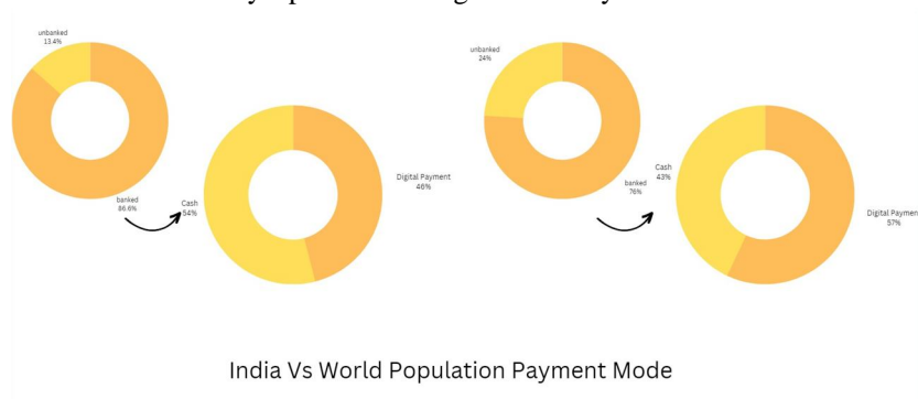
India Vs World Population Payment Mode

The implementation of the CBDC in India is proceeding methodically. Several banks are actively participating in this initiative, marking a significant step forward in the country’s pursuit of a digital currency.