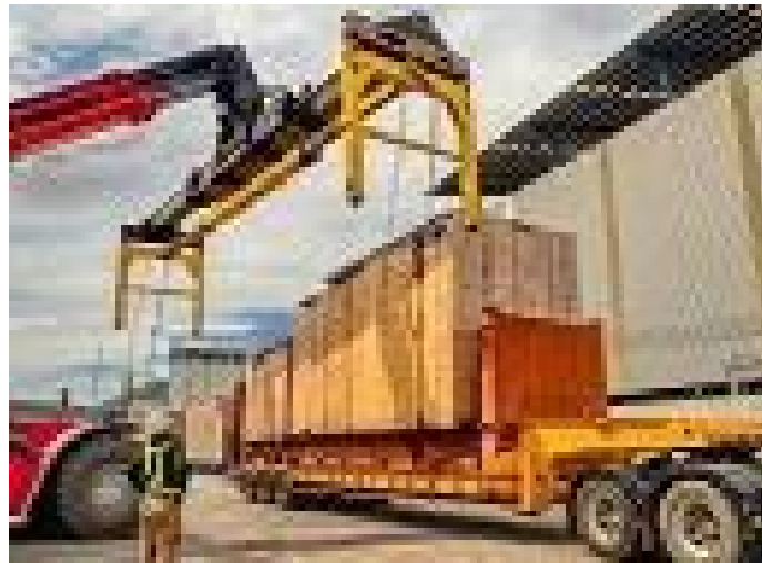
Fig. 9 Transportation Process