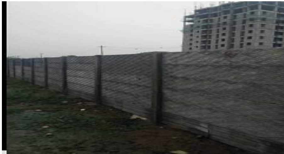
Fig. 8 Precast Compound Walls