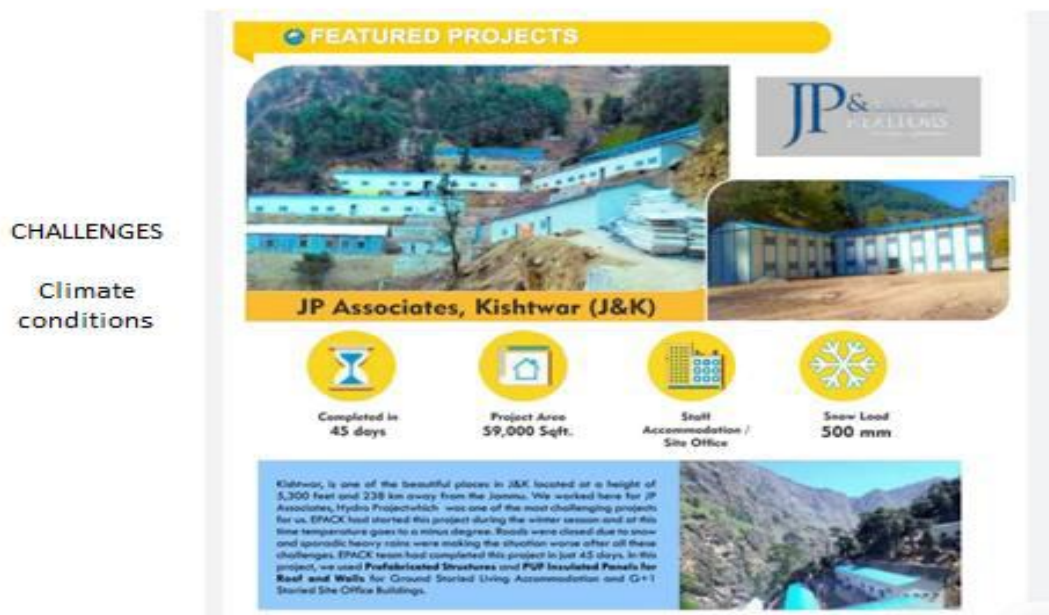
Fig.1 Featured Projects

EPACK, which was founded in 1999, has grown to become one of the fastest-growing infrastructure companies, specialising in the development of sustainable and solutions for smart building. In the previous 20 years, our products have served a wide range of sectors as well as several major government projects in India, as well as being sold overseas.