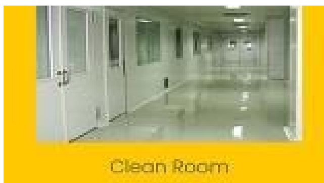
Fig. 4 Clean Room