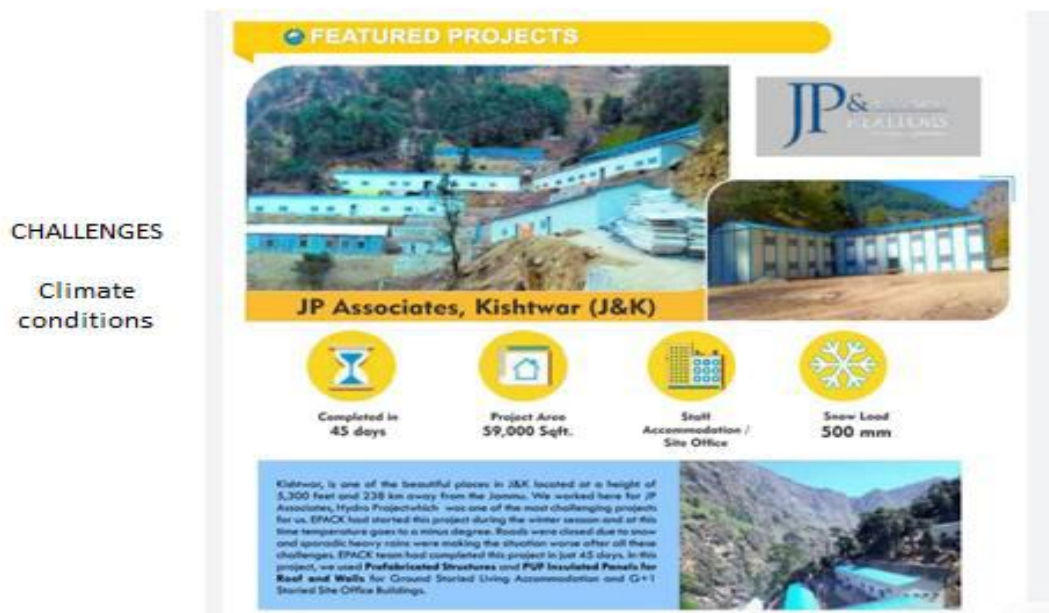
Fig.1 Featured Projects

EPACK, which was founded in 1999, has grown to become one of the fastest-growing infrastructure companies, specialising in the development of sustainable and solutions for smart building. In the previous 20 years, our products have served a wide range of sectors as well as several major government projects in India, as well as being sold overseas.