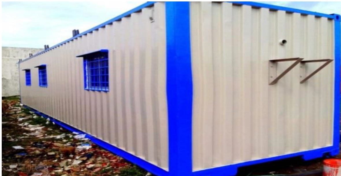
Fig. 6 Container Site Office