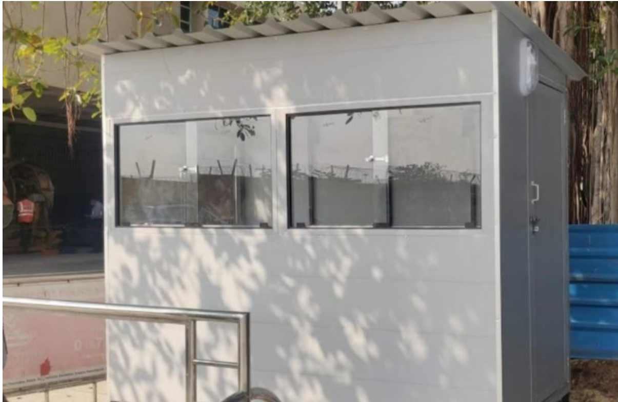
Fig. 5 Cabin