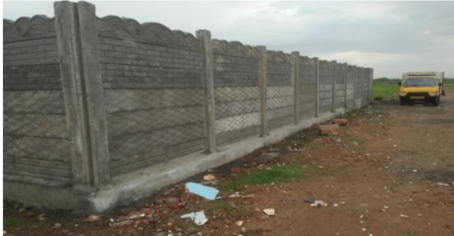
Fig. 7 Precast Compound Walls