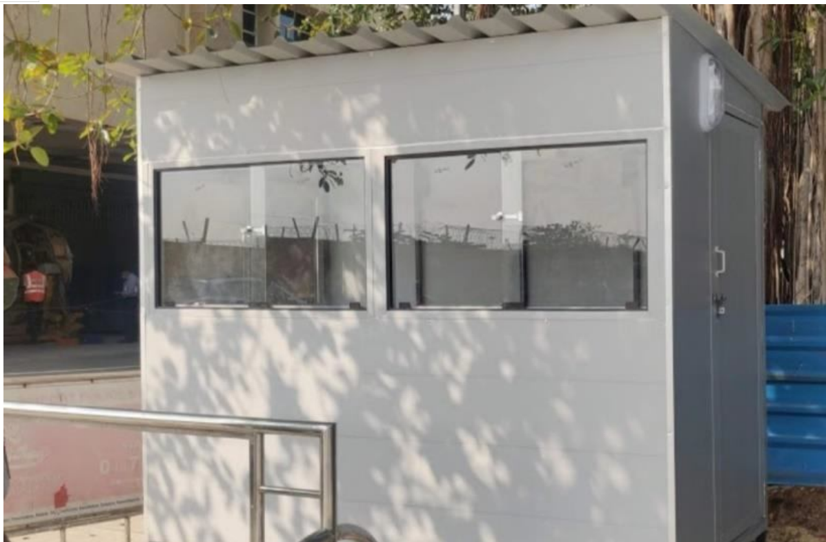
Fig. 5 Cabin