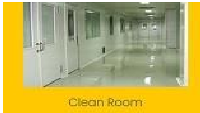
Fig. 4 Clean Room