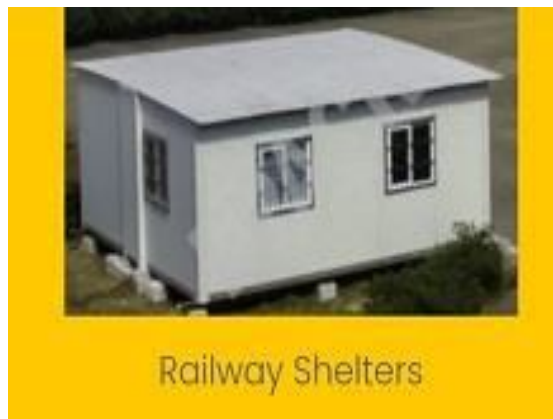
Fig. 3 Railway Shelters