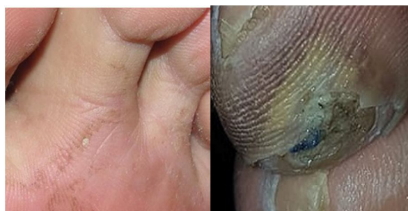
Normal (healthy) skin