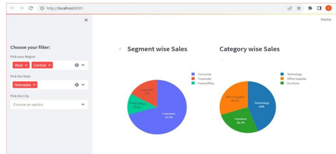
Fig. 3. Chart Analysis

In Fig. 3 we have shown another filtered output having the same filter inclusions above but this time it depicts 2 pie chart analysis diagrams.