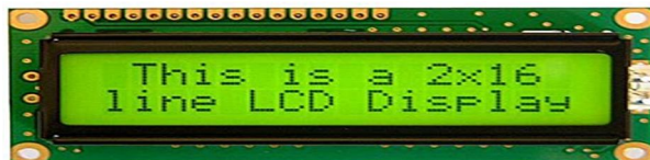
FIG. NO.: VI C.LCD DISPLAY

A flat-panel display or other electronically manipulated optical device that makes use of liquid crystals' ability to modulate light is known as a liquid-crystal display (LCD). Liquid crystals don't emit light directly; instead, they create images in either colour or monochrome utilising a backlight or reflector. There are LCDs that can show arbitrary graphics (like those on a general-purpose computer display) or fixed images with little information that can be seen or hidden, such text, numbers, and 7-segment displays like those found in digital clocks. They both make use of the same fundamental technology, however different displays use larger elements whereas random images are composed of a lot of tiny pixels. Computer monitors, televisions, instrument panels, cockpit displays in aircraft, and interior and outdoor signs are just a few of the many applications for LCD. Portable consumer electronics like digital cameras, watches, calculators, and mobile phones, especially smartphones, frequently use small LCD screens. Consumer electronics items like DVD players, gaming consoles, and clocks all employ LCD screens.