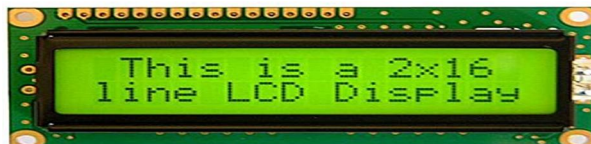
FIG. NO.: VI C.LCD DISPLAY

A flat-panel display or other electronically manipulated optical device that makes use of liquid crystals' ability to modulate light is known as a liquid-crystal display (LCD). Liquid crystals don't emit light directly; instead, they create images in either colour or monochrome utilising a backlight or reflector. There are LCDs that can show arbitrary graphics (like those on a general-purpose computer display) or fixed images with little information that can be seen or hidden, such text, numbers, and 7-segment displays like those found in digital clocks. They both make use of the same fundamental technology, however different displays use larger elements whereas random images are composed of a lot of tiny pixels. Computer monitors, televisions, instrument panels, cockpit displays in aircraft, and interior and outdoor signs are just a few of the many applications for LCD. Portable consumer electronics like digital cameras, watches, calculators, and mobile phones, especially smartphones, frequently use small LCD screens. Consumer electronics items like DVD players, gaming consoles, and clocks all employ LCD screens.