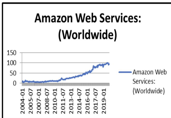
Figure 1. Amazon Web Services Growth Since 2004

Amazon Web Services (AWS) is one of the market's oldest providers, having been founded in 2006. Cloud storage, database service, analytics, network Internet of things, mobile computing, and enterprise services are among the computing services it offers. As a result of these services, an organization can develop at a faster rate, cut costs, and scale up its operations. AWS is one of the most well-known cloud platforms available, as it is one of the oldest cloud platforms on the market. As a result, AWS is widely used. AWS (Amazon Web Services) has 63 availability zones throughout the world.