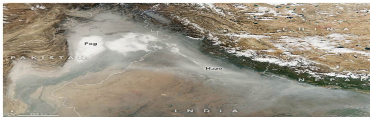
Figure 1: On November 8, 2017, a NASA Earth Observatory image of the Northern Indian States shows the distribution of haze and fog [24].

Because the nanoparticles were smaller and linger inside the atmosphere for just a greater amount of time than heavier ones do, the influence of fine particulates is exacerbated by air temperatures.