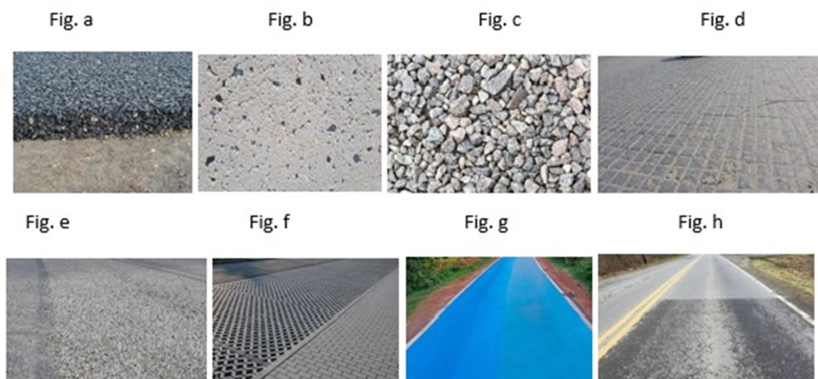
Figure. 2. Types of Road surfaces affecting the National Transport.

All of above road surfaces are a critical component of transportation infrastructure, and their selection depends on a variety of factors. The deterioration of road surface is divided into three factors i.e. personal factor, road environmental factor, and vehicle factor. In relation to traffic accidents, personal, road environmental, and vehicle factors are known to contribute 93%, 34%, and 13% of traffic accident [23]. Proper construction, regular maintenance, and consideration of factors like traffic patterns, climate, and budget are essential to ensure safe and reliable roadways.