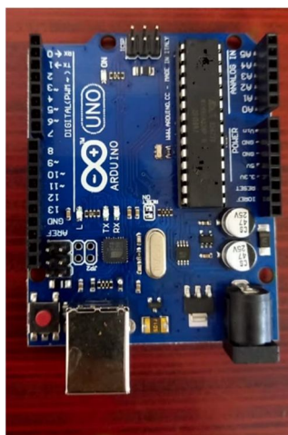
Fig 3. Arduino UNO