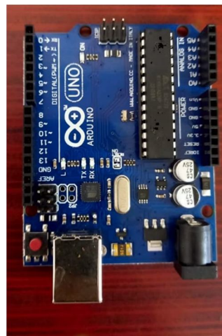
Fig 3. Arduino UNO