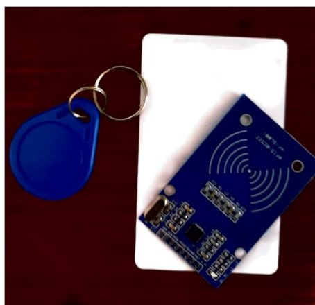
Fig 1. RFID Tag and Reader

The tag is magnetized and the information is decoded using a reader. Tags are used to store and process information. A reader sends out a radio frequency signal that the tag responds to. This energizes the pin or bar code, causing it to produce its own magnetic field with a unique interference pattern that corresponds to a unique number that the tag reads.