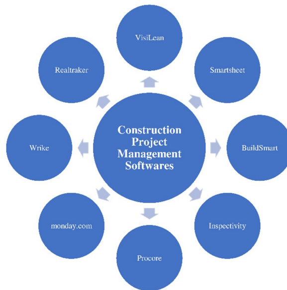
Fig 2: Web-based Construction project management software examples

The construction industry has seen a rise in web-enabled software that allows for the monitoring, control, manipulation, and storage of project information (Faraj, Faraj, Dr, & Professor, 1999). This data can then be made available to everyone. As a result, software now offers a wide range of tasks and features that have improved the cost-effectiveness and efficiency of project management (Wong et al., 2002). Some software offers more complete solutions for project management throughout its lifecycle than others. Fig 2 depicts certain number of web-based construction project management Softwares that are on trend.