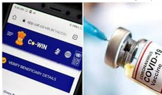
Figure 1. Co-Win Vaccine App

Individuals over the age of 18 can book appointments through COWIN or walk-in. All vaccine centers have registration desks, vaccine booths, and observation rooms. Vaccine certificates can be downloaded digitally through COWIN.