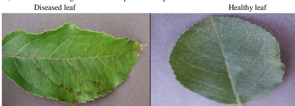
Figure 2: Sample images present in the data set