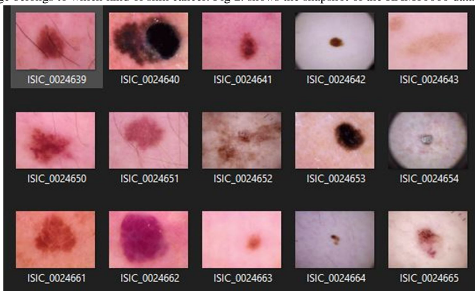
Fig. 2 The HAM10000 Dataset Samples

The HAM10000 dataset is just an aggregation of different kinds of skin cancer images. We require a huge amount of data to build deep learning models that give accurate results. To solve our problem, we require a very specific collection of labelled skin lesion images. The HAM10000 dataset consists of 10015 dermoscopy images obtained from skin patients from Australia and Austria. Out of the 10015, 6705 images are noncancerous, 1113 are cancerous and 2197 images are unknown. The images come with a csv file denoting which image belongs to which kind of skin cancer. Fig 2. shows the snapshot of the HAM10000 dataset.