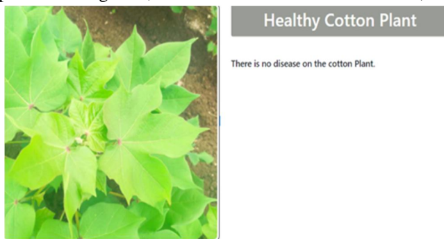
Fig.4:Output prediction(Healthy cotton plant)

After saving a model create web application using html,css and then connect with Flask . So, here are some output prediction below.