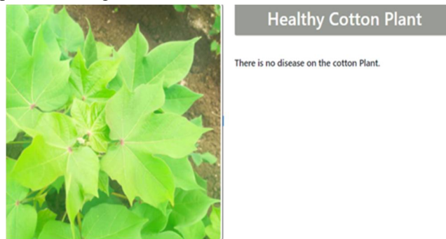
Fig.4:Output prediction(Healthy cotton plant)

After saving a model create web application using html,css and then connect with Flask . So, here are some output prediction below.