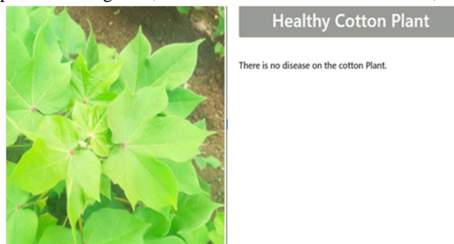
Fig.4:Output prediction(Healthy cotton plant)

After saving a model create web application using html,css and then connect with Flask . So, here are some output prediction below.