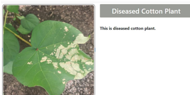
Fig.5:Output prediction(Diseased cotton plant)