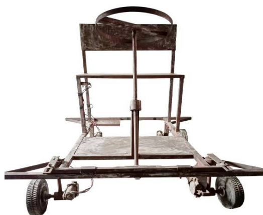
Fig.3. Fabrication Work