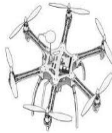
Fig 2 2D model of hexacopter

Why we choose a hexacopter is to lift the heavier components, when compared to the quadcopter the lifting capacity of this hexacopter is more. It can fly stable in windy situation and can lift heavy materials like battery, frame, CO2 balls, spray can, camera, and many more components.