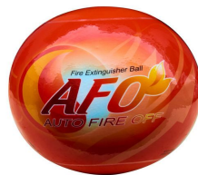
Fig 2 Fire extinguisher ball

The fire uses oxygen and expels carbon dioxide. So, carbon dioxide burned gas so when we throw CO2 into the fire it helps to reduce oxygen which is responsible for the fire. Carbon dioxide is a gas and is easy to store and distribute. So it is easy to carry using a small container and we can spray the carbon dioxide on direct fires. Carbon dioxide mixes with oxygen and separates the fire from oxygen.