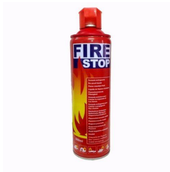
Fig 1 Co2 Spray

The fire uses oxygen and expels carbon dioxide. So, carbon dioxide burned gas so when we throw CO2 into the fire it helps to reduce oxygen which is responsible for the fire. Carbon dioxide is a gas and is easy to store and distribute. So it is easy to carry using a small container and we can spray the carbon dioxide on direct fires. Carbon dioxide mixes with oxygen and separates the fire from oxygen.