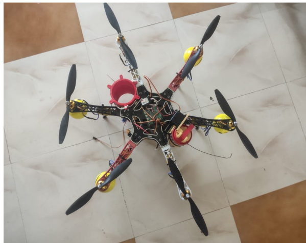
Fig - Drone full setup