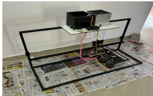
Fig. 3 Fabricated Model