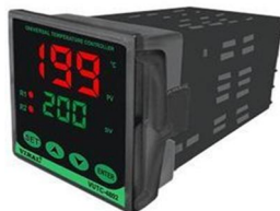
Figure 2. Universal temperature controller.

The operator panel consists of universal temperature controller (UTC) powered by 230v, that is controlling the temperature of the head [Fig. 2]. Temperature data is provided by thermocouple K placed in the head. The heater of power 40W is connected to this device and powered by 12V. This allows reaching temperature up to 250°C. On the left side, we can see PWM controller with built-in on/off switch, that is responsible for controlling spool rotation speed.