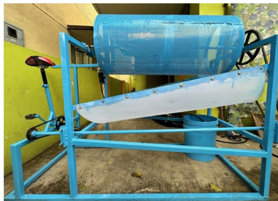
Fig 2: Fabricated Model of Root Vegetable Washer

The below given figure is the fabricated view of Root Vegetable washer. The frame was first made according to the calculations and the dimensions which were instructed, the drum was fixed to the frame with the help of supporting bearings the drum is further connected to a pulley which is further connected to a shaft which transmits required power from the pedals which is manually operated. The vegetables are fed into the washer from the side of the drum carefully, further the nozzles are fixed to the side from where the water jet is sprayed on to the vegetables where they are cleaned the vegetables are then taken out from another side of the drum, the water flows through the mesh where it is again re-circulated to the drum through the pipe.