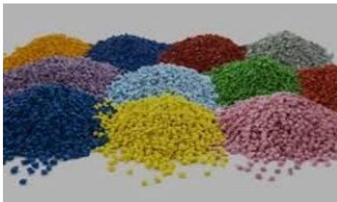
Fig.4. Material Used