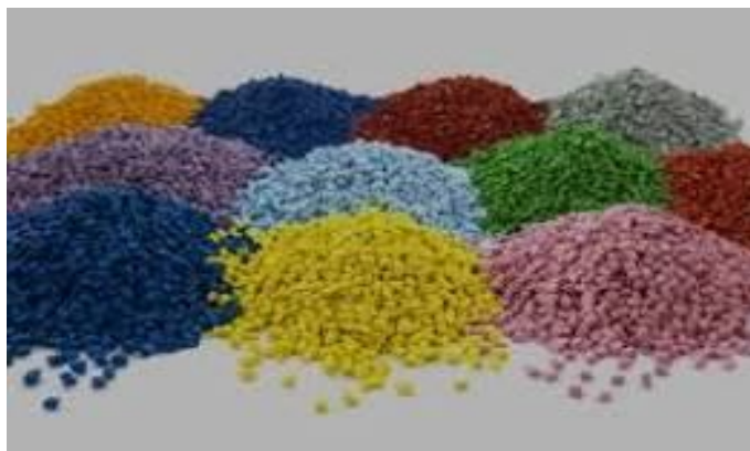
Fig.4. Material Used