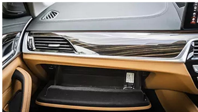
Figure 2. Powered Glove box