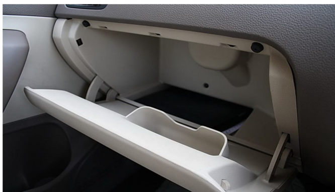
Figure 1. Manual Glove box