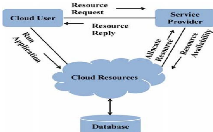
Fig 2: Resource Allocation