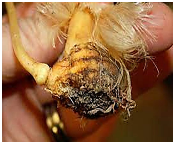
Figure 1. Corm rot in Saffron

Corm rot, attributed to the fungus Rhizoctonia crocorum , is a prevalent disease that primarily targets saffron corms. Corms serve as underground storage organs responsible for nutrient storage and facilitating new plant growth. The onset of the disease is marked by small, water-soaked lesions on the corm surface, which gradually expand and darken in color. Infected corms exhibit a soft, deteriorated texture, impeding healthy growth and resulting in diminished flower production. Several factors, including excessive moisture, inadequate soil drainage, and suboptimal corm storage conditions, can contribute to the initiation and propagation of corm rot [29]. Figure 1 shows corm rot in Saffron .