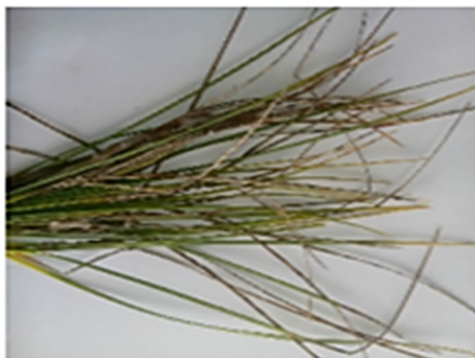
Figure 2 Leaf Blight in Saffron