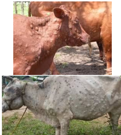
Fig. 2. Affected with Lumpy Diseases