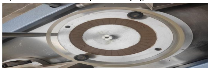
Figure 1. Ring shear test

The Ring shear test was conducted as per ASTM D6467 – 06 to determine drained residual shear strength of soil sample. The lower porous plate and sample container assembly are removed from the machine by undoing the two knurled retaining nuts and lifting this assembly clear of the two locating studs. This is facilitated by swinging the proving ring turrets and load hanger clear of water bath. A remolded sample can then be kneaded evenly into the annular cavity using a small spatula. The top of the sample is then struck off level with the top of the confining rings, and the assembly placed in position, on the locating studs. The upper platen is then fitted, this locates on the centering pin, which is given a light smear of oil. The water bath needed not be removed during this operation. The settlement dial gauge is then mounted to bear on the top of the loading yoke screw adjuster. If a very soft sample has been prepared, it is important to allow time for it to come into equilibrium under the load of the upper platen, and then subsequently the load of the lever loading system. When the soil is fully consolidated it may be sheared at the appropriate rate. During both consolidation and shearing, the sample should be flooded to prevent it drying out.