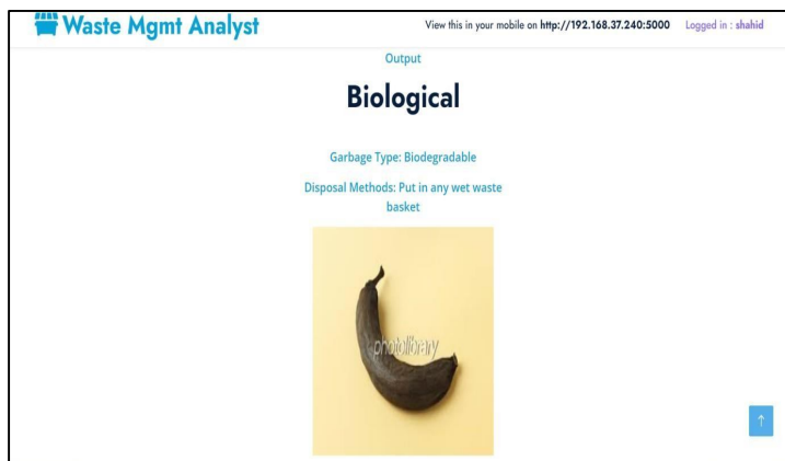
Fig. 3 Prediction and Classification

The above figure 2 shows the screenshot of the garbage class prediction and classification into biodegradable and non-biodegradable waste.