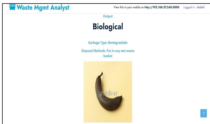
Fig. 3 Prediction and Classification

The above figure 2 shows the screenshot of the garbage class prediction and classification into biodegradable and non-biodegradable waste.