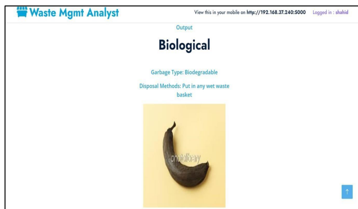
Fig. 3 Prediction and Classification

The above figure 2 shows the screenshot of the garbage class prediction and classification into biodegradable and non-biodegradable waste.