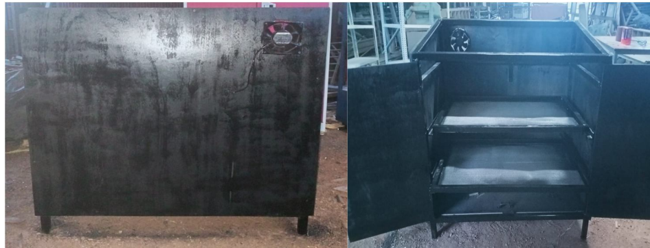
Fig 4.3 Working model of solar tray dryer