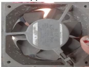
Fig 3.4.3 Exhaust fan

Exhaust fan are used for maintaining proper ventilation in a chamber. They help in removing the bad air and humid air from the chamber and keep the room filled with fresh air. In our project we use 10 watt exhaust fan. Inside the chamber there we stored some fruits, leaf, vegetable for drying purpose, the drying purpose maximum temperature of the chamber is 72 degree centigrade, this much range temperature is best for drying. When chamber temperature is high, to maintain the chambers temperature we use exhaust fan for air ventilation and also remove the water drop present into the inside the glass.