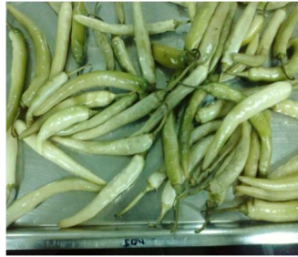
Chili after drying in Inside