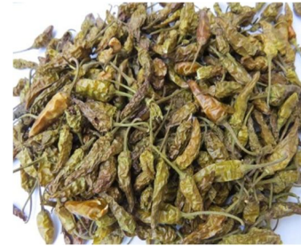
Chili after drying in outside