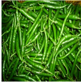
Chili before drying