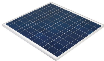
Fig 2.4.2 Solar panel

Solar powered technologies convert sunlight into electrical energy either through photovoltaic (PV) boards or through mirrors that concentrate sun based radiation. This energy can be utilized to generate electricity or be stored in batteries or thermal storage. Solar panel is use renewable energy to produce electricity .This is also pollution free .In our project there is 10 watt exhaust fan is installed, to operate this fan we want electricity, so we installed 40 watt solar panel to generate 18 volt ectricity and operate the exhaust fan for air ventilation.