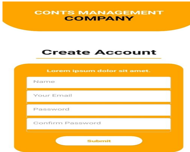
Fig 4.2.1 create account

Users can input their unique username/email and password on the login screen. Our system verifies the credentials against stored user data to authenticate the users. Upon successful authentication, users gain access to the platform's features and project data based on their assigned permissions.