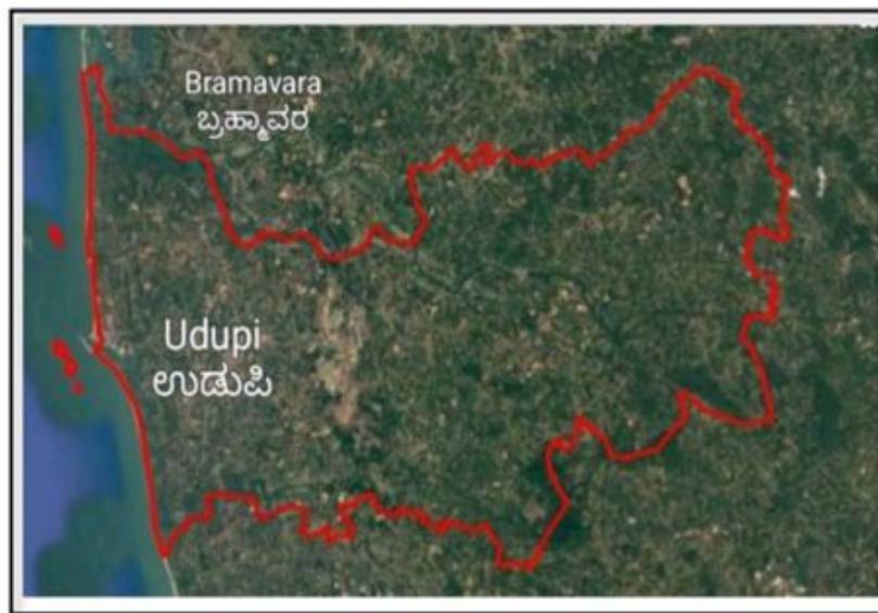
Figure 2.4.2 Study area -Udupi District