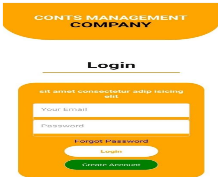
Fig 4.2.1 Login page

Users can input their unique username/email and password on the login screen. Our system verifies the credentials against stored user data to authenticate the users. Upon successful authentication, users gain access to the platform's features and project data based on their assigned permissions.