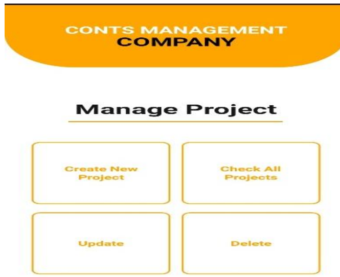
Fig 4.3.1 Home page & filling the project details

In home page they are four section namely, create new project, check all projects, updates and delete. create new project section filling the project details in that project name, client name, Location and estimated cost. All the details are filled in that submit it. Check all projects it will show the project details.