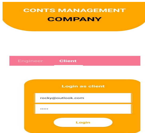
Fig 4.5.1 Login to Client page

A list of all clients associated with the construction company. Including details such as client name, project details, and billing details. Provides a snapshot of current and past projects associated with each client and Project Details Include project status, timeline and budgets. Provide clients with secure access to view project details and documents.