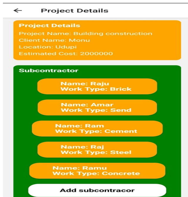
Fig 4.4.2 Details of subcontractor's page

Add subcontractor in that section name of subcontractor, work types are filled above fields and submit it. All the details of subcontractors comes in page of project detail page.