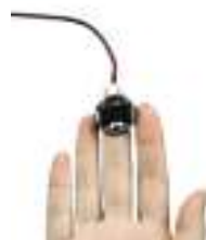
Fig.5. SPO2 sensor

STEP 1: The Heartbeat and pulse oximeter sensor is fixed to the patient's finger. This contains an IR sensor in it. Every pumping we get pulse from that sensor. This sensor output is given to the arduino via Signal conditioning unit for amplification.