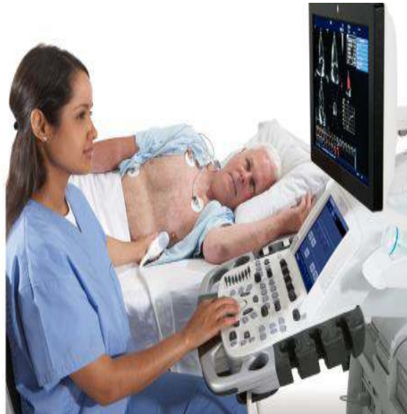
Fig.1. Existing System

Traditionally, health monitoring systems have been restricted to fixed setups, detectable only when patients are within hospital premises or confined to their beds. Current accessible systems are typically large-scale and limited to hospital settings, primarily in Intensive Care Units. However, recent advancements have enabled the utilization of Zigbee technology to transmit patient information directly to their caregivers or attending physicians.