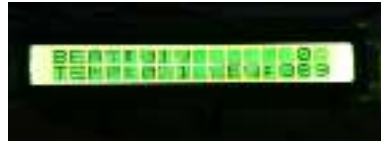
Fig.6. Output in LCD Display

All these values are transferred to LCD display and it is transferred to the mobile app created.