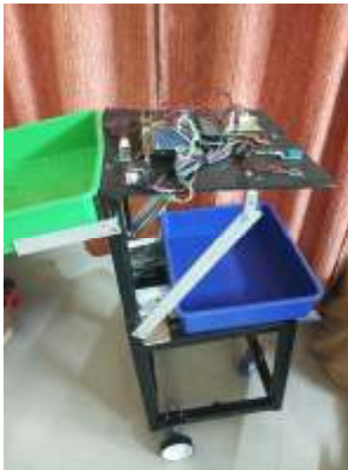
Fig. 4. Project model