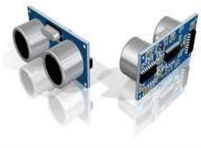
Fig2: Ultra sonic sensor module